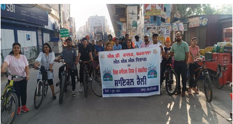
Awareness Cycle Rally on 3<sup>rd</sup> June 2023