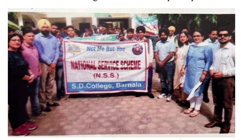
Environment awareness rally against stubble held on 4th October 2019

NSS unit organised an environment awareness rally against stubble burning in adjoining villages Pharwahi, Dangarh, Kattu and Uppli on 4<sup>th</sup> October 2019. Volunteer interacted with local farmers and made aware them about the ill effects of smoke produced during stubble burning. More than 60 individuals including staff and students participated in the event.