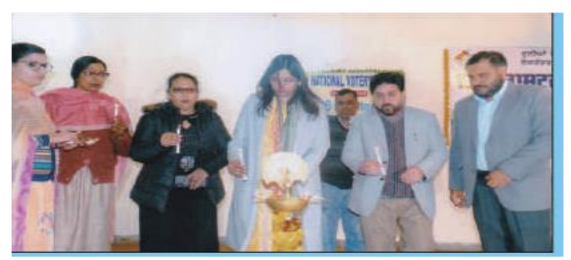
Seminar on National Voter Day (25th Jan., 2020)

On the occasion of National Voter Day (25 January, 2020), SD College Barnala, organised seminar in which Deputy Commissioner Shri Teg Partap Phoolka honoured PWD employees for their services in issuing voter card. Besides this, chief guest also honoured people who offered their services during Lokh Sabh election 2019. Students presented skit on this occasion. Student were motivated to cast their vote and strengthen the democracy. About 130 individuals participated in the event.