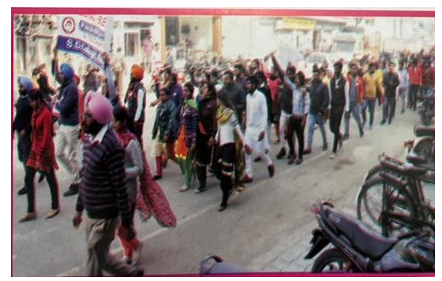
Prabhat Pheri carried out under the program "Healthy India and Fit Punjab"

Cadets along with Health Officials made aware the citizens about clean eating, stay active and less use of salt and sugar etc. About 100 students participated in the event.