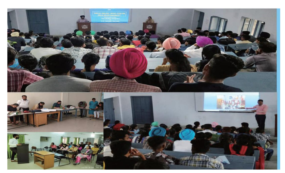
Glimpses of awareness event "Buddy Program" held on 23 March, 2019.

With the mission to fight against Drug Abuse in state, The Govt of Punjab have been running first of its kind initiative called Buddy Program. Under this Program, the college organised many activities like lecture, debate competition, poster competition and PPT presentation on 23 March, 2019. The Buddy program aims to educate student about the ill effects of drug abuse and generates positive peer influence. Student developed knowledge, right attitude and behaviour along with skills to prevent drug abuse. This program is key to Punjab fight against drugs as it covers the adolescent age groups and young adults. More than 800 students participated in the event.