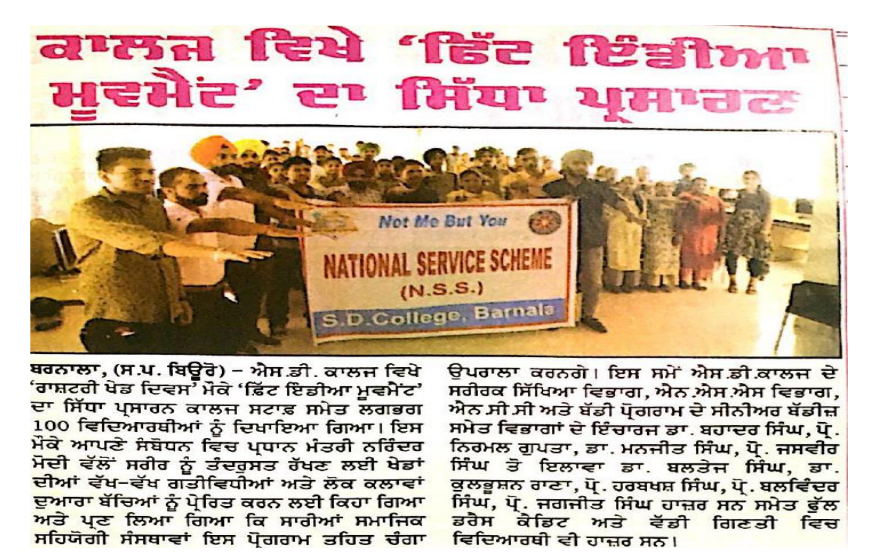
News cutting of event "Fit India Movement" (29 August, 2019).

On the occasion of National Sports Day, Teachers and students of SD College Barnala watched Fit India Movement broadcast (29 August, 2019). Honourable PM Modi Ji advised students about the fitness and inspired them to cooperate with social organisation to make this movement huge success. More than 100 individuals participated in the event.