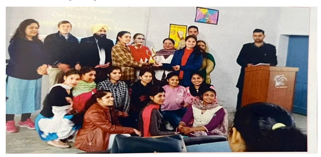
Awareness Program against "Tobacco Use" held on June 6, 2021

Awareness Program against Tobacco Use was organised on June 6, 2021. Students took a pledge for not taking Tobacco and other drugs which are injurious to health. Students were appealed to make aware the other people of society also such as neighbours, community workers and their friends. Poster-making and slogan writing competitions were held on this topic. About 130 students participated in the event.