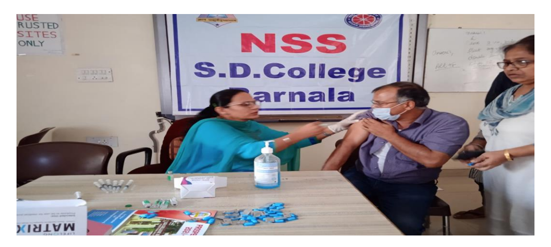
Glimpses of "COVID Vaccination Drive Camp-V" on 14th August, 2021