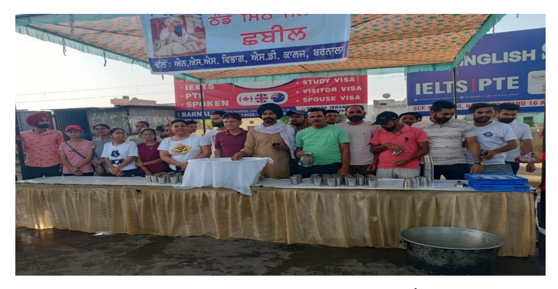
Glimpses of Sweet Water offerings (Chabeel) on 3rd June 2022