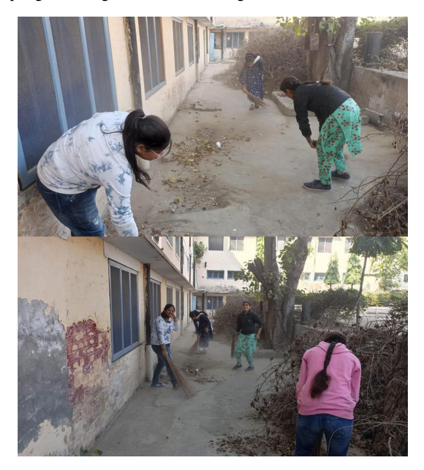
Cleanliness Drive (26th Nov., 2022)

BUT YOU". During this camp 120 volunteers participated in the cleanliness drive and also planted 115 saplings in college and its surroundings.