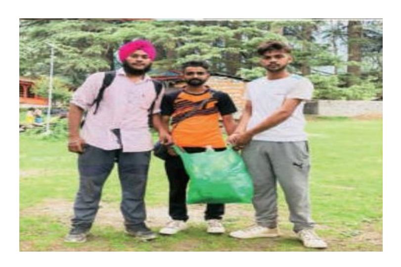
Hiking Trekking Camp in Manali from 20th July 2018 to 30th July 2018

The Department of Youth Services, Barnala organized a Hiking Trekking Camp in Manali from 20<sup>th</sup> July 2018 to 30<sup>th</sup> July 2018. In this camp, seven students of our college participated. During trekking, they collected plastic disposables, bottles etc. which caused pollution in hilly areas at the altitude of 8000 ft.