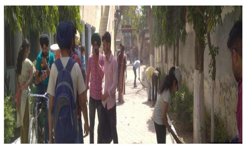
Cleanliness drive in month of October, 2021

During the month of October 2021, NCC cadets carried out the cleanliness drive in the College campus and vicinity. About 78 students took part in the event.