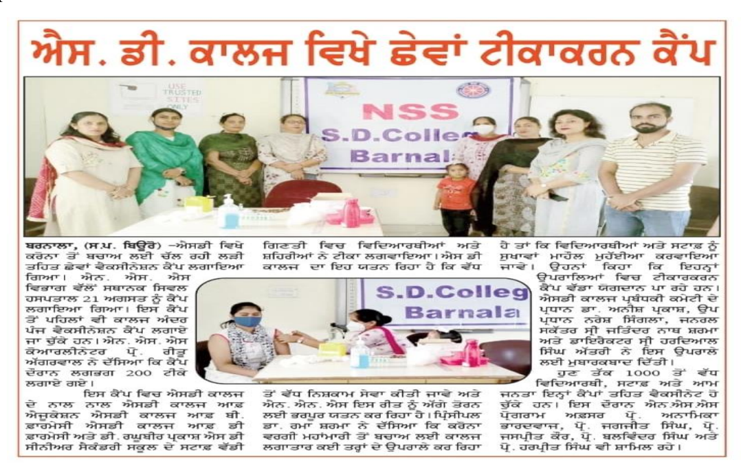
News cutting of "COVID Vaccination Drive Camp-VI" on 21st August, 2021

On 21<sup>st</sup> August 2021 NSS department collaboration with Civil hospital Barnala held its 6<sup>th</sup> consecutive corona vaccination camp in the college campus. 200 people including staff members from other institutes of S.D. Educational Institutions, citizens and students took advantage of this camp and got vaccinated. 200 people including students get vaccinated in the camp.