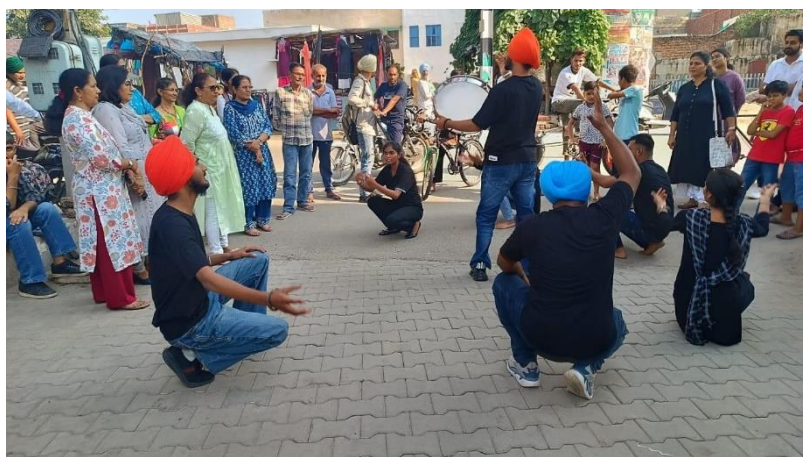
Glimpses of Cycle Rally, Symposium and Nukkad Natak on 28th September, 2022