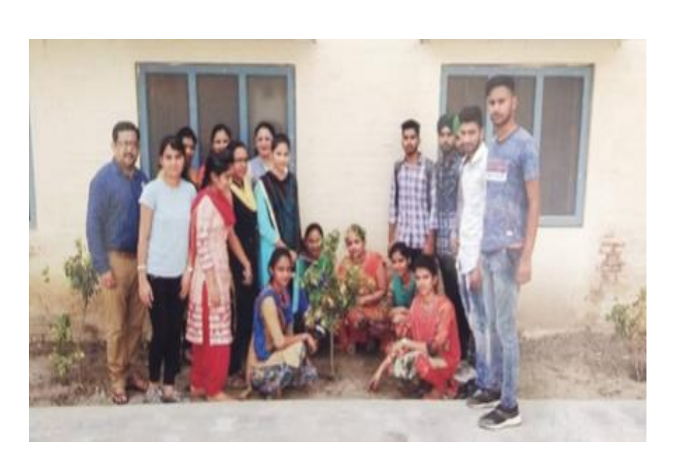
Tree plantation Drive (14th July 2018)

On 14<sup>th</sup> July 2018, the Department of Computer Applications organized a tree plantation event with the help of forest department. During this event, 50 saplings were planted at various places in the city like civil hospital, bus stand and in the college campus.