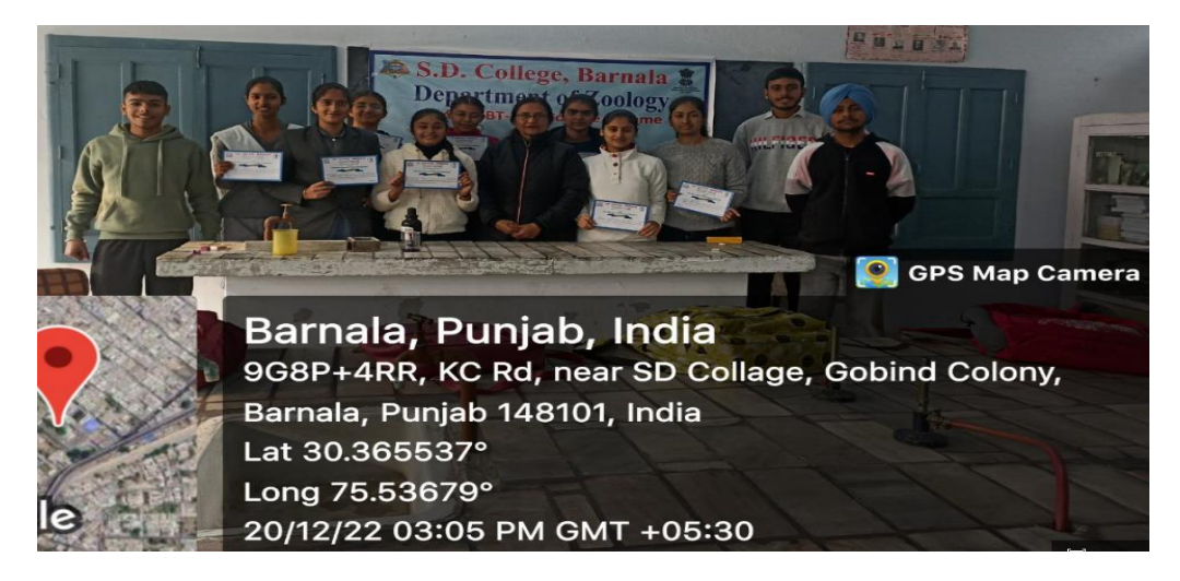
One Week hands on training for school students in Zoology (13-20 December, 2023)

12 students of class 12<sup>th</sup> of Sarvhitkari Vidya Mandir Sen. Sec. School, Barnala participated in the training. Students got training regarding blood pressure, blood group, bleeding time, clotting time and animal taxonomy.