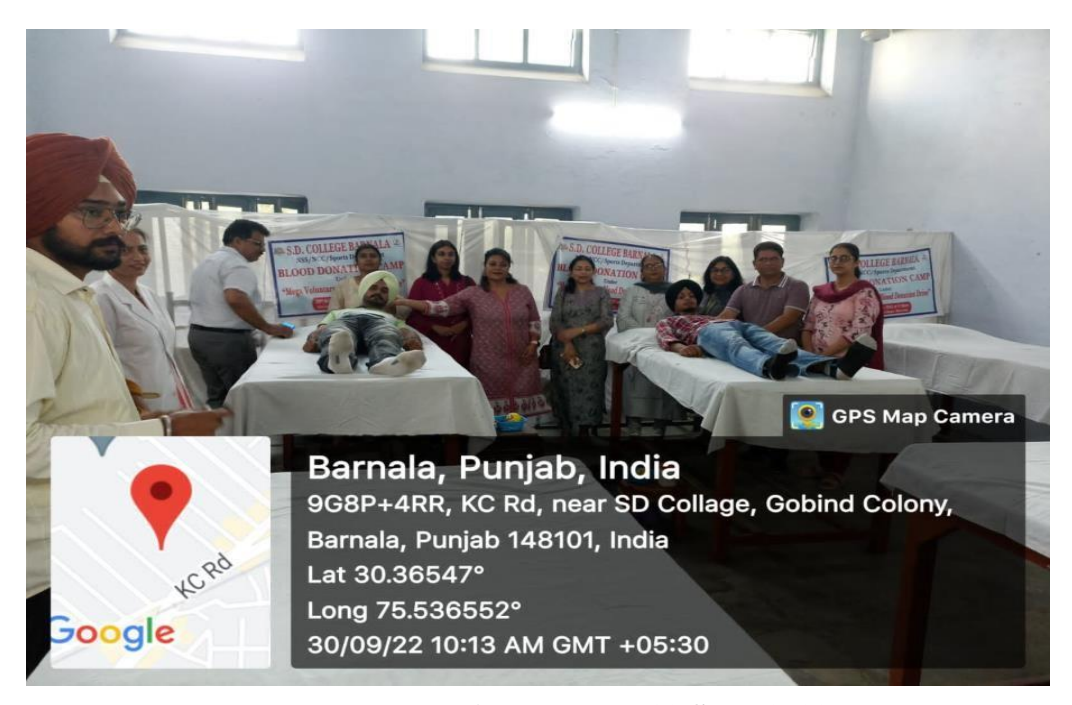
Blood Donation camp on 30 Sept. 2022