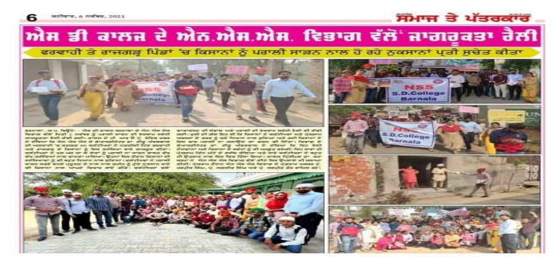
News cutting of rally regarding "Stubble Burning Awareness" on 2<sup>nd</sup> November 2021