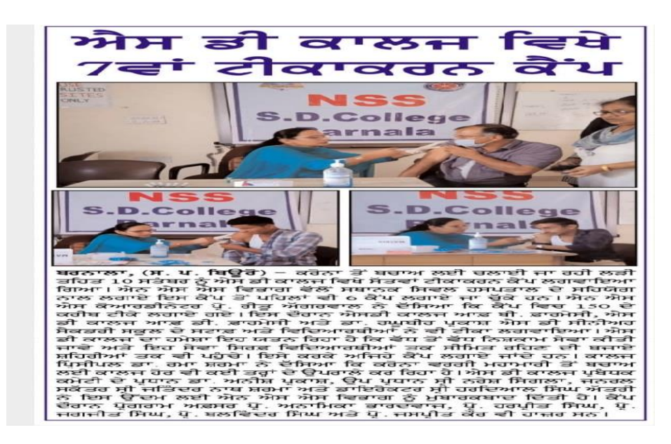
News cutting of "COVID Vaccination Drive Camp-VII" on 10th September, 2021