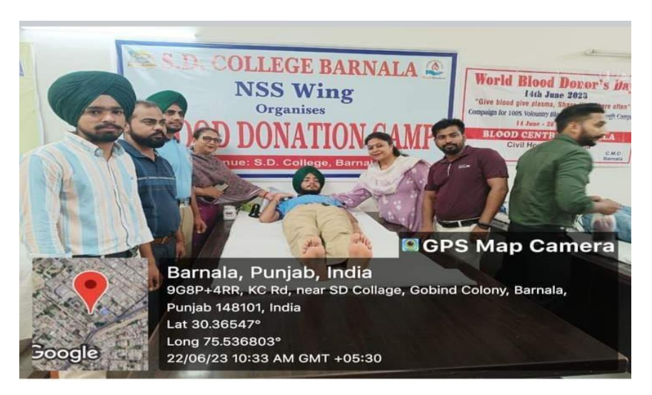
Blood Donation Camp on 22<sup>nd</sup>June

NSS wing in collaboration with NCC Wing of the college organized Blood Donation Camp on 22<sup>nd</sup>June, 2023 under the drive " Organization of World Blood Donor Day 2023 ". Faculty members, NSS and NCC volunteers donated 31 units of blood. The medical team, Civil hospital Barnala assisted in organizing this camp. The purpose of the camp was to instill the feeling of empathy for their fellow human beings among volunteers. Volunteers were sensitized about their responsibility for the community and society. The camp was successful in breaking away certain myths regarding blood donation. About 150 students took part in the event.