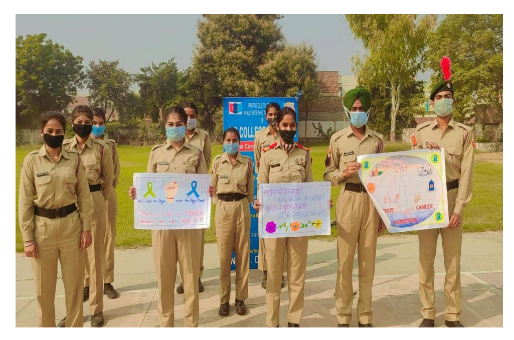
Cancer Awareness Rally and Competitions held on 7 Dec., 2020.

NCC Unit of S.D. College Barnala celebrated "Cancer Awareness Day" on 7 Dec., 2020. On this day poster making competition has been organized. During this activity cadets and college students made posters and pasted them in the city to aware locals about this dreaded disease. About 23 students participated in the event.