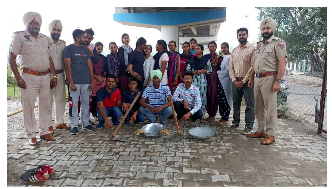
One Day NSS Camp

To instil the dignity of manual labour and to promote the essence of NSS motto 'NOT ME BUT YOU' NSS department organized a one day camp in college campus on 29<sup>th</sup> March 2022. 160 volunteers beautified the campus/surroundings such as Kacheri Chowk and did various cultural activities like singing and shared their views on social issues like female foeticide.