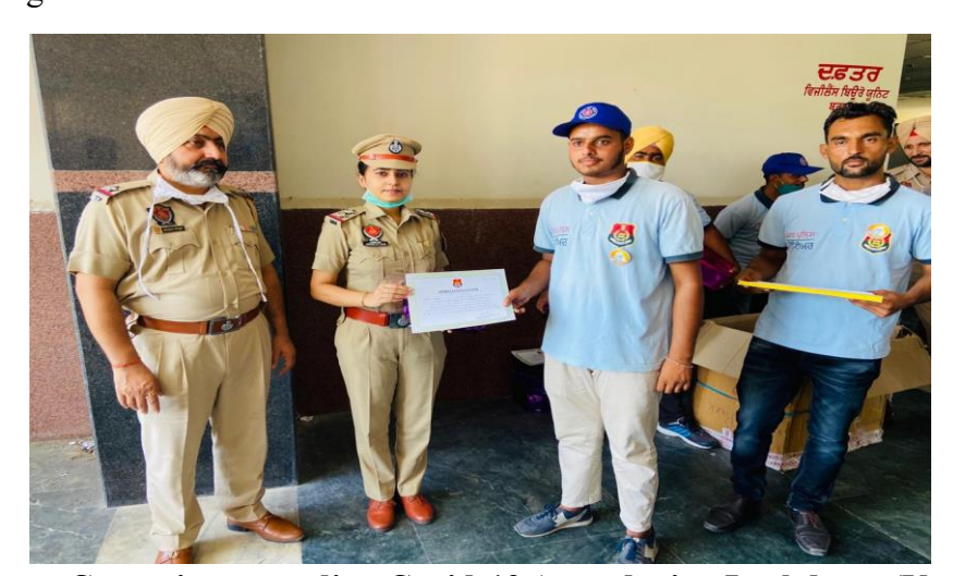
Awareness Campaign regarding Covid-19 Apps during Lockdown (Year 2020)

During the beginning of Pandemic Covid 19, NSS volunteer SD college Barnala in collaboration with District Administration Barnala assisted the people to download the Arogya Setu App and Covid 19 Apps. They took out this awareness drive from door to door also. Some volunteers also assisted Punjab police during lockdown. About 39 students volunteered for the awareness campaign.