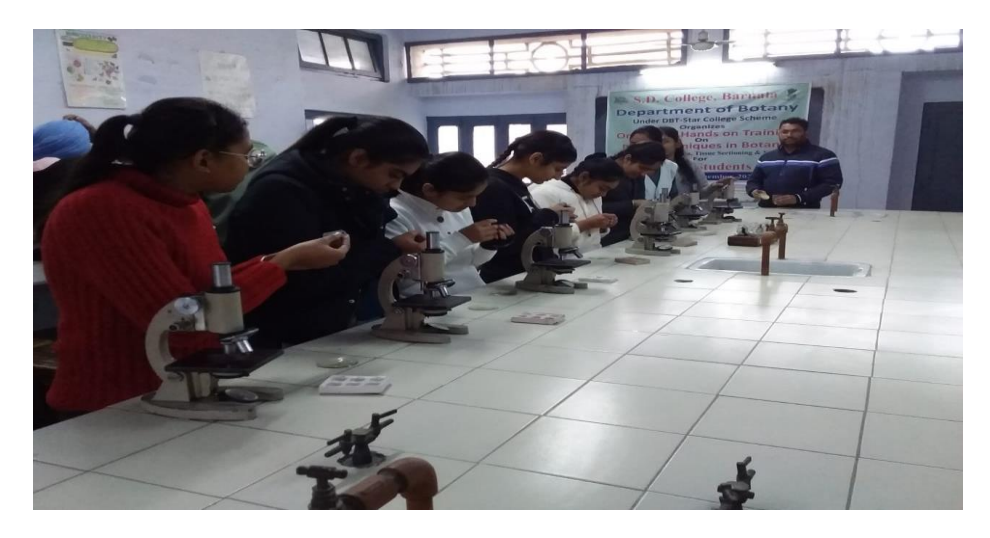
One Week hands on training for school students in Botany (13-20 December, 2023)