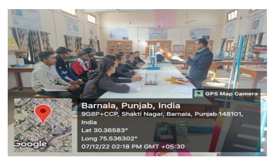
One Week hands on training for school students in Physics (5-12 December, 2023)