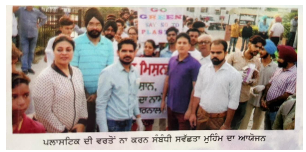
Rally on 'No plastic Movement' held on October 2<sup>nd</sup>, 2019"

Volunteers of NCC/NSS and Program Officers participated in the rally on 'No plastic Movement' on October 2<sup>nd</sup>, 2019 conducted by District Administration volunteers collected plastic Bags and envelops from the entire city and spread the message of 'No plastic' among the citizen of Barnala. Around 150 volunteers participated in the awareness program.