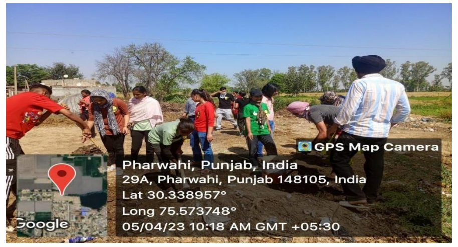
Seven Day and Night Camp at Village Pharwahi (4th -10th April 2023)