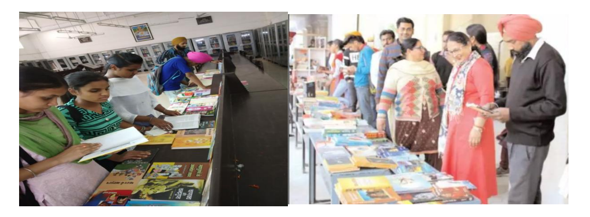
Glimpses of the book exhibition related to Freedom Struggle on 15 August, 2018.

The College Organised a Book Exhibition related to Freedom Struggle on 15 August, 2018. This exhibition included the books on different Freedom fighter in our freedom struggle. It was open exhibition in which citizens and students from different institution participated. More than 400 individuals participated in the event.