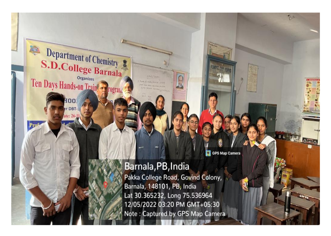
12 Days hands on training for school students in Chemistry (26 November-5 December, 2023)

Department of Chemistry organized 12 days, Hands-on Training Programme for 12<sup>th</sup> standard students of Sarvhitkari Vidyamandir Sen. Sec. School Barnala from 26<sup>th</sup> Nov to 05<sup>th</sup> Dec 2022. In this training programme, students performed practicals related to volumetric analysis, salt analysis & crystallization etc. About 20 students took part in the training