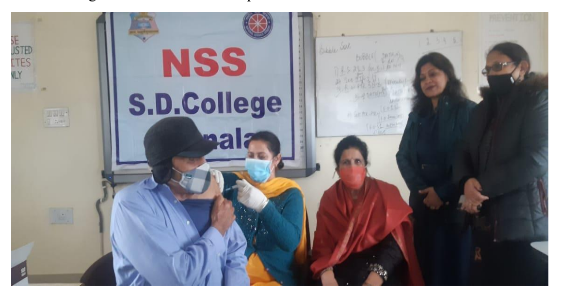
Glimpses of "COVID Vaccination Drive Camp-VII" on 14 Jan, 2022

On 14<sup>th</sup> January, 2022, NSS department collaboration with Civil hospital Barnala organized its eighth corona vaccination camp in association with civil hospital Barnala. Around 150 students and citizens got vaccinated in the camp.