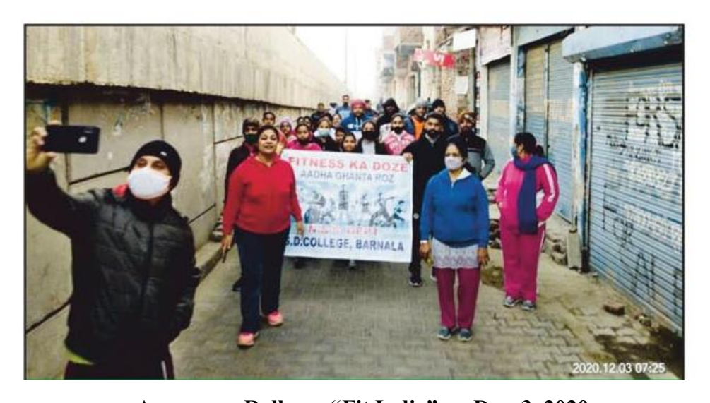
Awareness Rally on "Fit India" on Dec. 3, 2020

NSS Department organized a rally on "Fit India" on Dec. 3, 2020. The main motive of this rally was to describe preventive measures against spreading of Coronavirus disease. More than 100 students participated in the event.