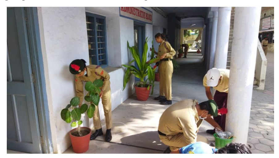
Conservation Drive to Save the Plants and Trees in the month of September, 2021

To save plant and trees of the campus and surroundings, NCC unit of the college carried out in the month of September, 2021. During this event, NCC cadets carried out tilling, deweeding and manuring of plants. About 45 students took part in the event.